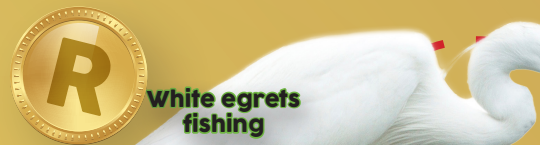
White egrets fishing

Pip does not have a parrot as they don't come to the UK. Many birds do though. Can you spot the ones here on your journey? Can you find any others?