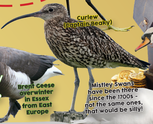
Curlew (Captain Beaky)