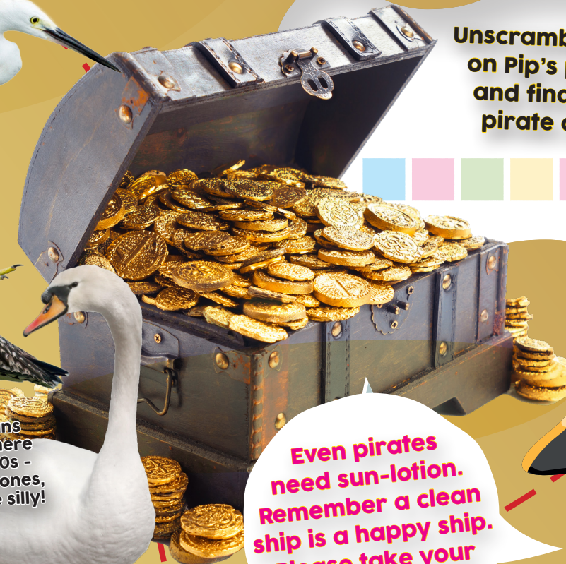
Mistley Swans have been there since the 1700s - not the same ones, that would be silly!

Unscramble the letters on Pip's pirate coins and find the secret pirate codeword.